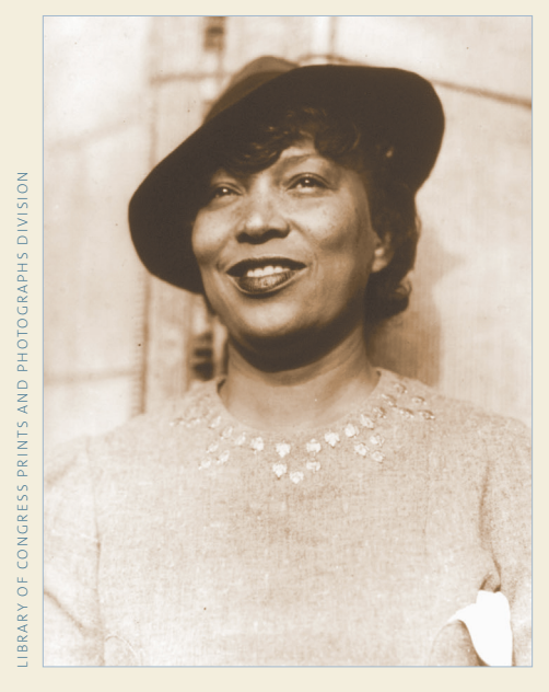
Portrait of Zora Neale Hurston in midlife (above) and image of program from the 2000 premiere of "Polk County" at the Library.